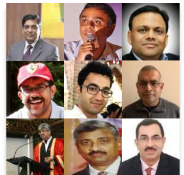
Alumni Visiting Faculty Members

We also wish our alumni who've been a part of the Alumni Visiting Faculty Program as professors, imparting industrial knowledge to students to better prepare them for their careers ahead. We are thankful to have such supportive alumni who've been helping the Institute and its students with their immense knowledge and expertise in their fields.