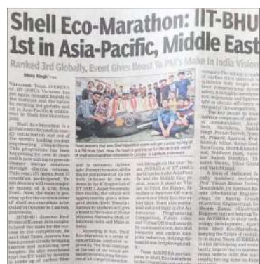
Team AVERERA ranks first in Asia-Pacific region in Shell Eco-Marathon