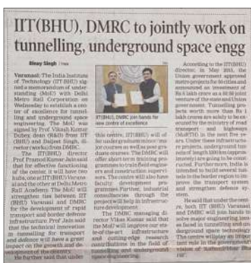
MoU signed between IIT (BHU) and DMRC in underground space engg.